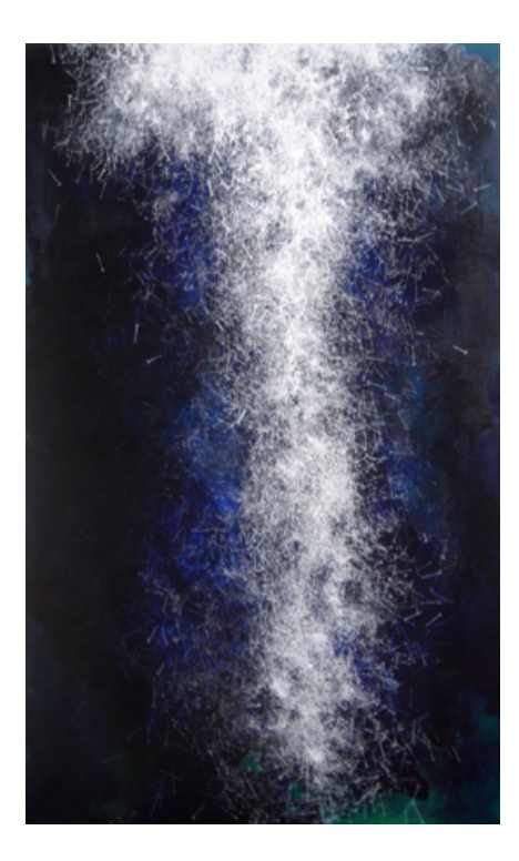
45,328 (Nails) - 48.25 x 30