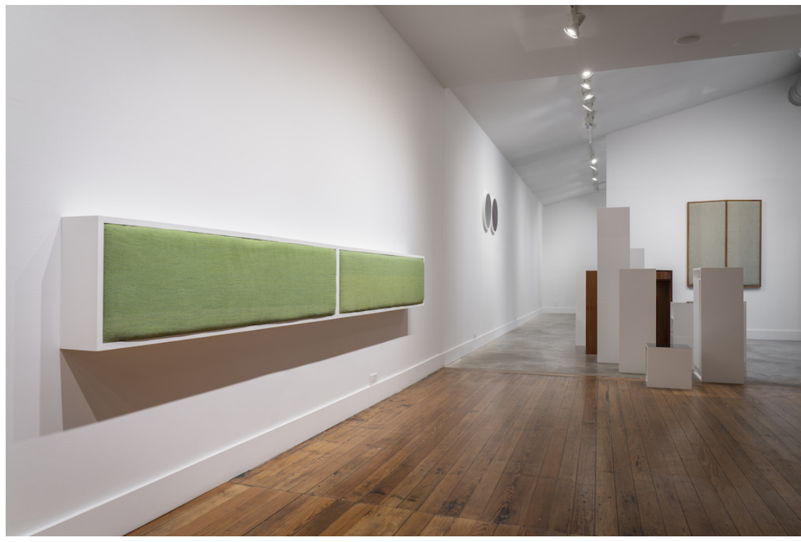
Ana Esteve Llorens "Untitled (A Long Horizontal Green I & II)," installation view at Grayduck Gallery.

No Linear Narrative: Ana Esteve Llorens - Sightlines