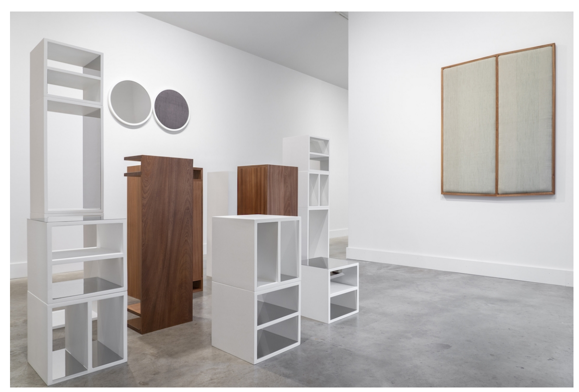
Installation view of "Ana Esteve Llorens: Space is a Reality" at Grayduck Gallery, Jan. 11-Feb. 23, 2020. In the foreground is "Untitled (Units for Space), "2020."

In a solo exhibition at Grayduck Gallery, Ana Esteve Llorens constructs an open-ended narrative through craft techniques and industrial processes