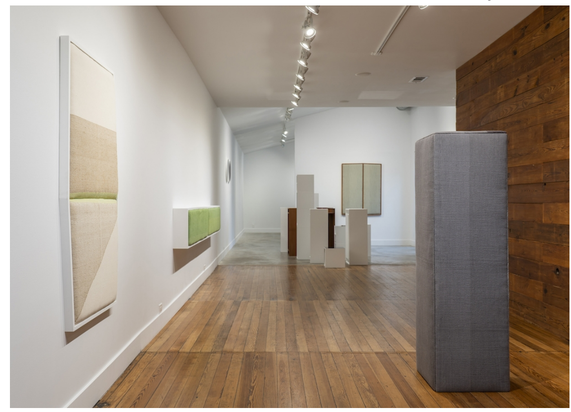
Installation view of "Ana Esteve Llorens: Space is a Reality" at Grayduck Gallery, Jan. 11-Feb. 23, 2020.

No Linear Narrative: Ana Esteve Llorens - Sightlines