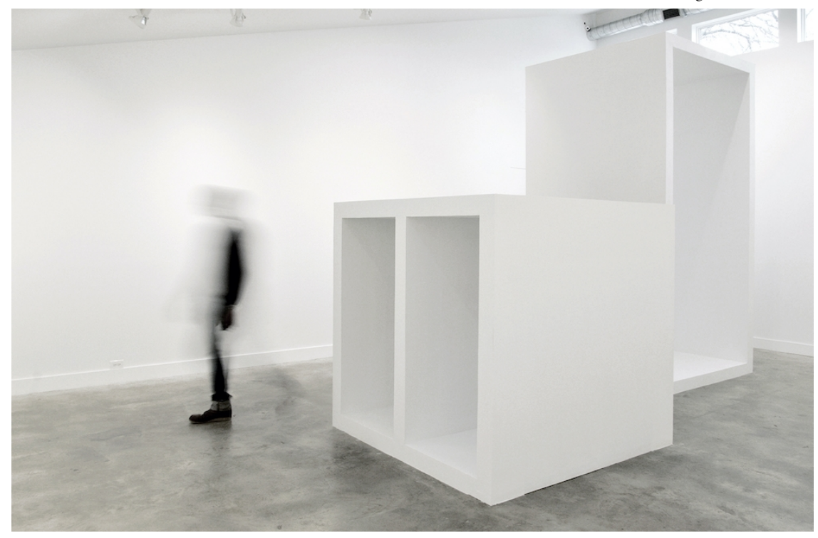
Installation view of "Ana Esteve Llorens: Space is a Reality" at Grayduck Gallery, Jan. 11-Feb. 23, 2020.

Llorens's exhibition is full of juxtapositions — of nature existing beside the machine, of the inside blending with the outside, and of objects that are both strange and yet familiar.